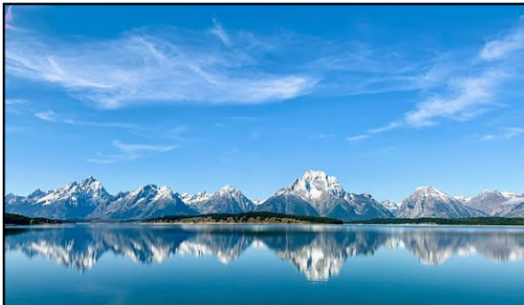
TIXC: Keys to Respondent Contact "What we do for one, we do for the other"